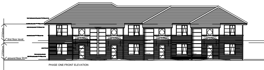
PHASE ONE: FRONT ELEVATION