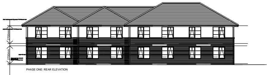
PHASE ONE: REAR ELEVATION