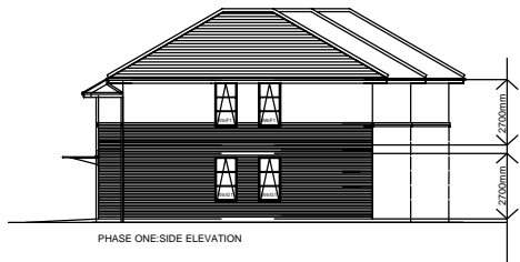
PHASE ONE: SIDE ELEVATION